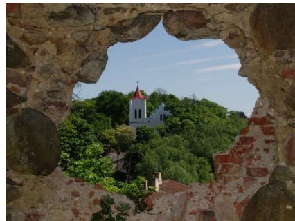
The town Aizpute

11:00 visiting the modern Latvian painter's studio J.Kalnmalis