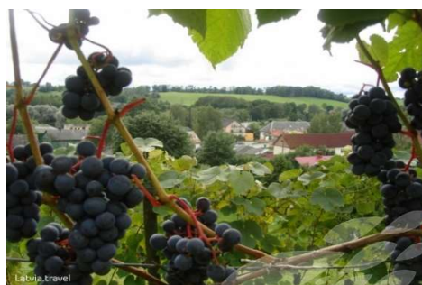
The winehill of Sabile.