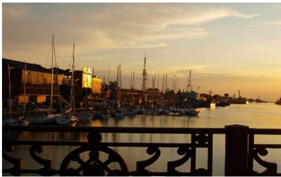
Liepaja. The city channel

13:30 Lunch at a restaurant in Liepaja (Promenade Hotel.) Visiting Promenade Gallery