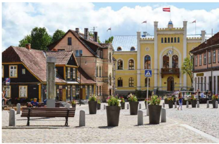
Kuldiga. Townhall square

13:30 Lunch at one of the Kuldiga restaurants (“Goldingen Room”)