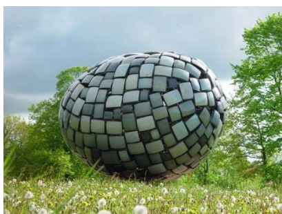
Sabile. Pedvale Open-Art Museum