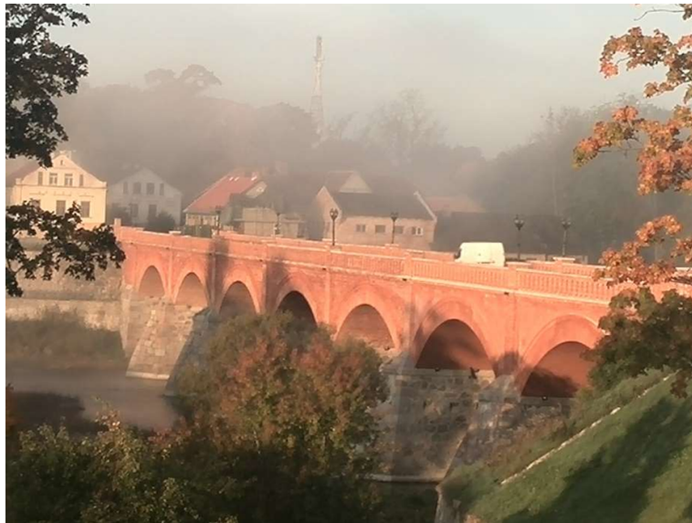
Kuldiga. The old brickbridge over the Venta