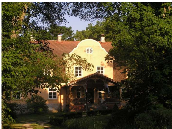
Maras manor. Kuldiga region

Accommodation: guest house Maras manor in Kuldiga region