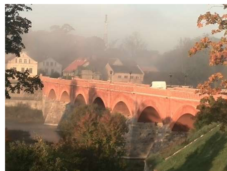
The old brickbridge over the Venta