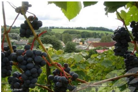
The winehill of Sabile.